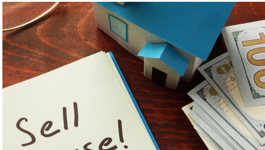
2017 Housing Market Survey

There are many great reasons nearly 90% of sellers use a listing Agent according to the National Association of Realtors. Selling a home is time consuming, out of pocket expenses for marketing, having knowledge of neighborhood trends, and excellent negotiating skills.